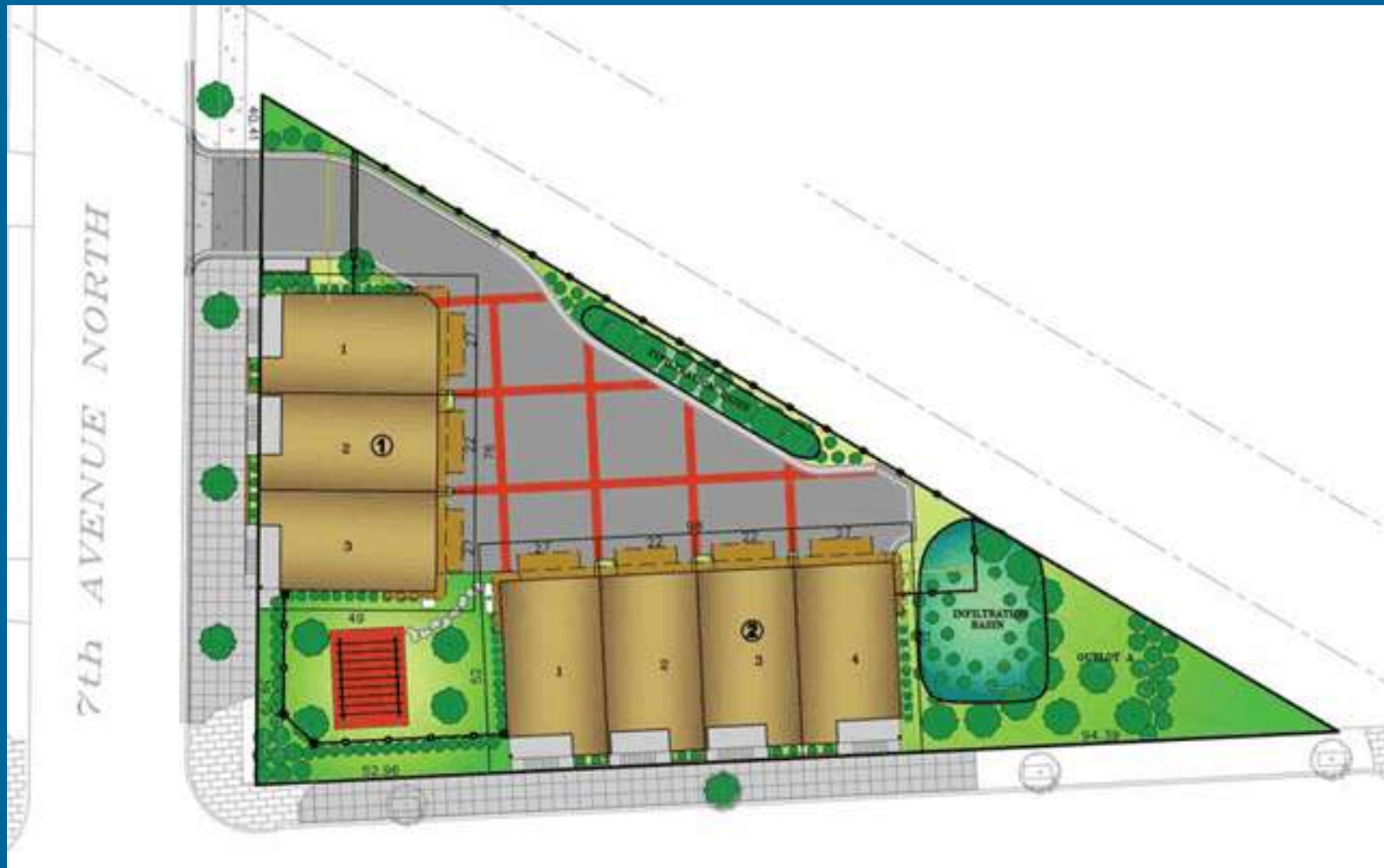
Marketplace & Main Site Plan